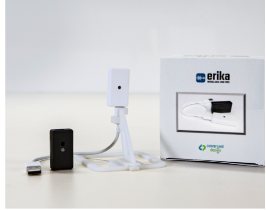
Erika Wireless USB Microphone System